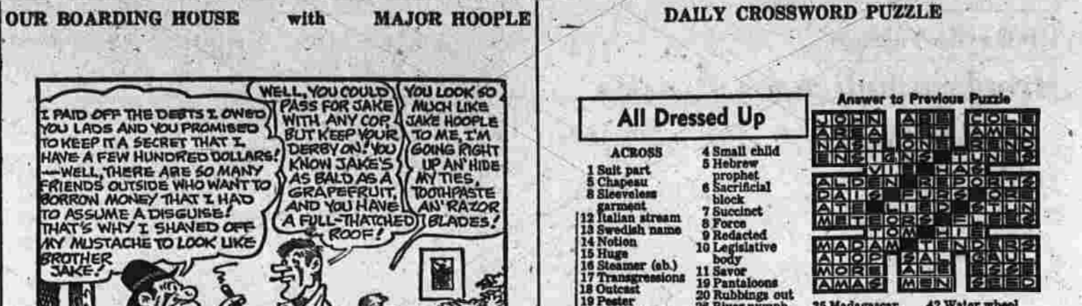
OUR BOARDING HOUSE